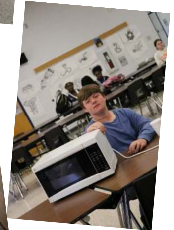
Anything but a Bookbag :