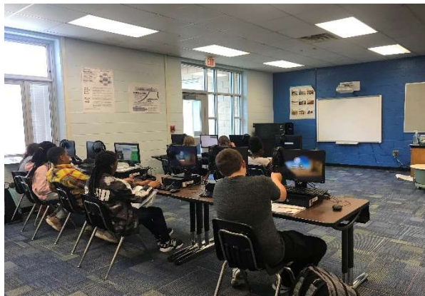
New class at ALCMS- Math 180